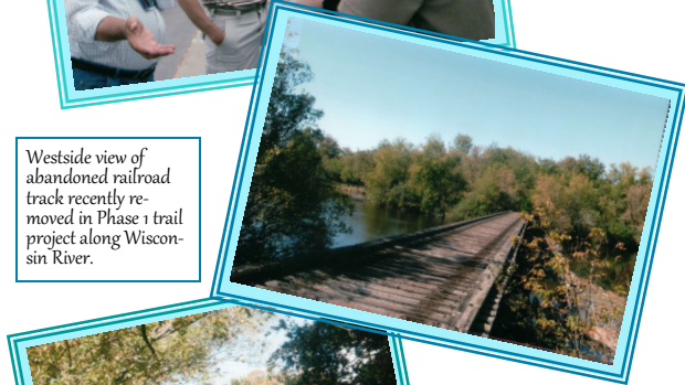
Westside view of abandoned railroad track recently removed in Phase 1 trail project along Wisconsin River.