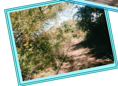
Westside view of abandoned railroad track recently removed..